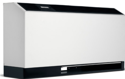
Standard length: 48"